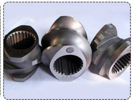
Technical Parameter Of Core Filling Snack Machine