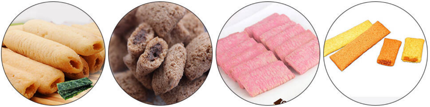
Core Filling Snack Machine Samples