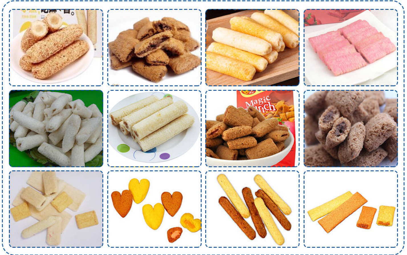
SAMPLE PICTURES OF 120KG-1200KG/H CORN PUFF MAKING MACHINE/ PRODUCTION LINE FOR RICE

Crustaceans, crispy corners, shell crisps, brown rice rolls, small screws, salads, pizza rolls, cat's ear crisps, escargots, oat rolls, etc.