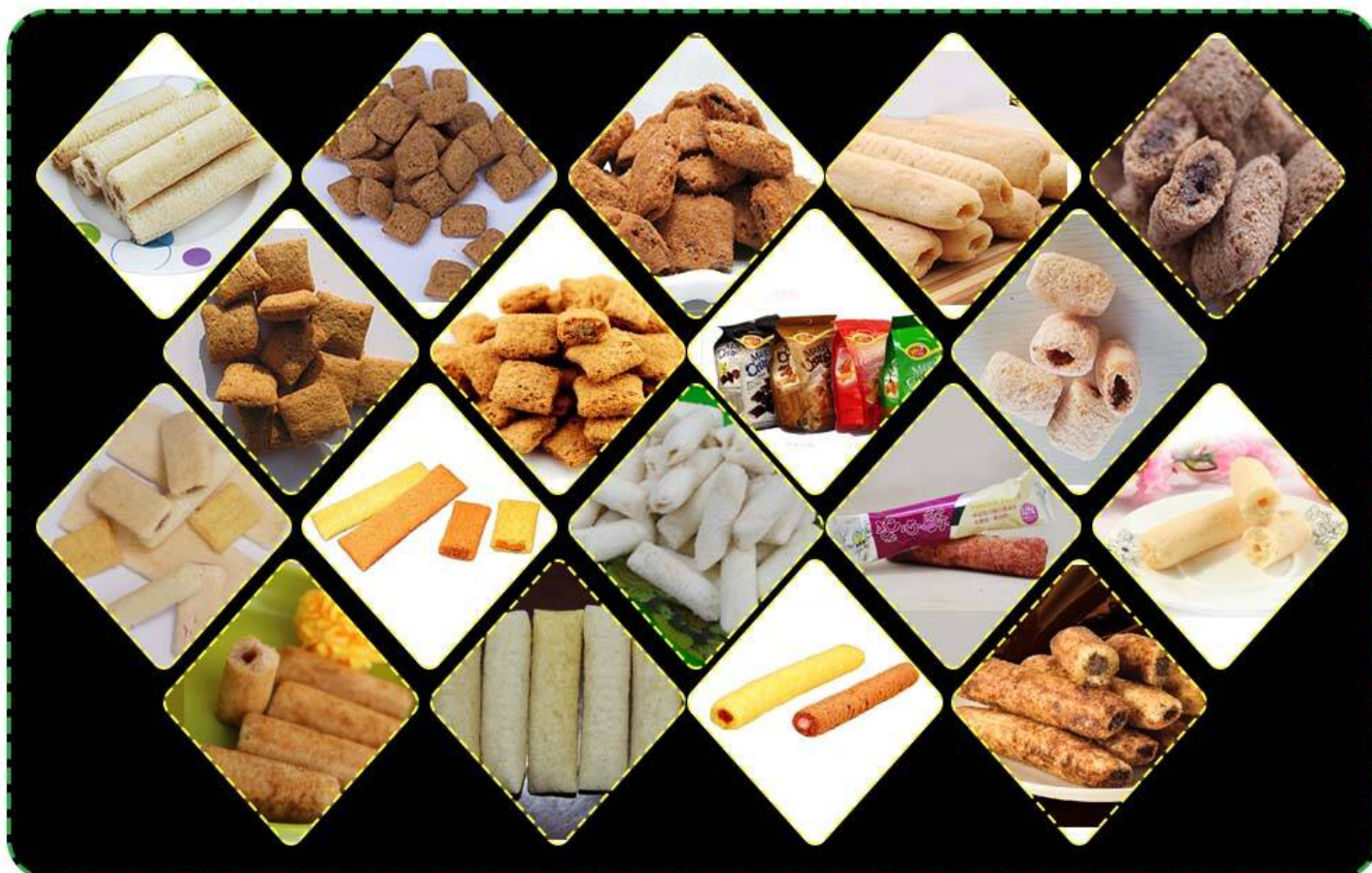
SAMPLE PICTURES OF 120KG-1200KG/H CORN PUFF MAKING MACHINE/ PRODUCTION LINE FOR RICE