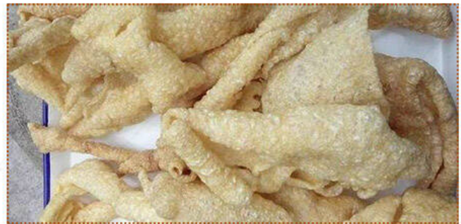
Application of Industrial Pork Rinds Frying Machine