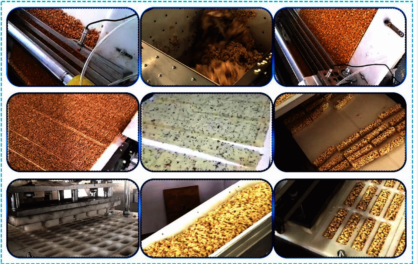
Display of finished products