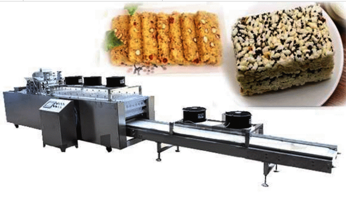
snack bar production line