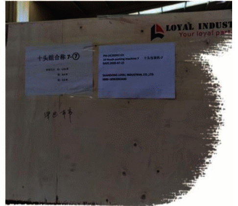
Packaging & Shipping