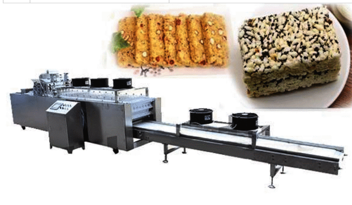
snack bar production line